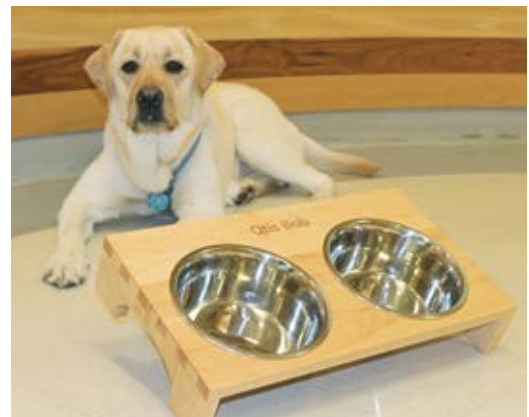
The 2018-19 Wood Enterprise Institute dog bowl stand and one satisfied customer.