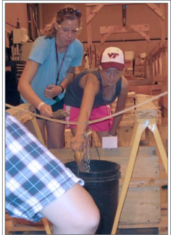
YCC students see how much a piece of wood will bend before it breaks.

For 36 years, the Virginia Association of Soil and Water Conservation Districts has sponsored the week long YCC summer event. The event sponsors students to spend one week learning about Virginia's resources through hands-on experiences to help them gain a deeper understanding and respect for the environment and our natural resources. Photos of the 2013 YCC activities can be seen online at the Virginia Association of Soil & Water Conservation Districts' Facebook page.