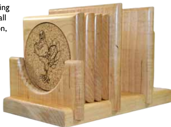
The 2011-12 WEI product: Napkin holder and coaster set.

Many thanks go to our sponsors and donors who make the Wood Enterprise a premier learning experience. Please visit www.vtwei.com for more information.