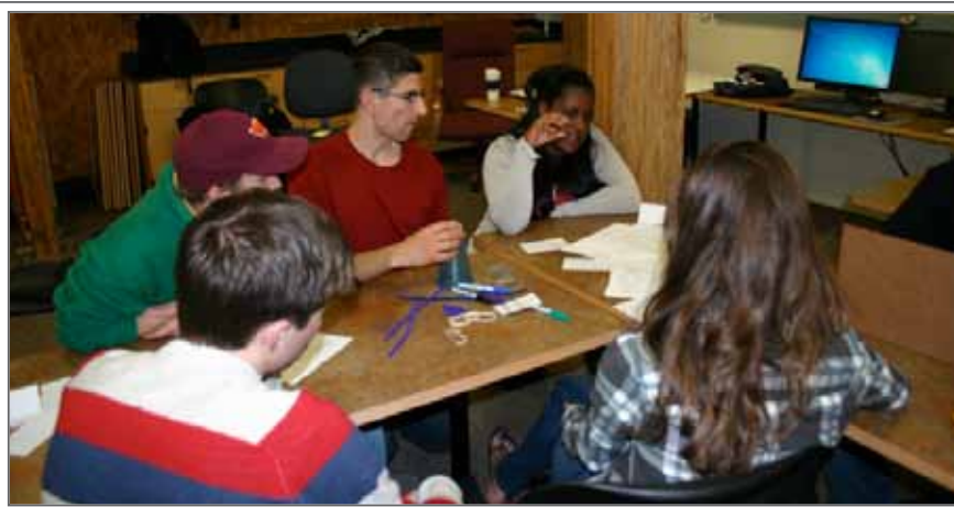
Students discuss how to best use the materials they won.