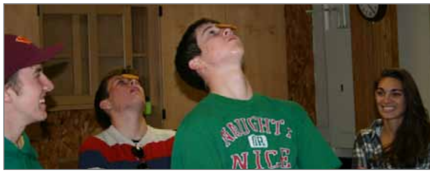
Students complete the “Forehead to Mouth Cookie Challenge” to win materials for their egg package.

The laboratory reinforced concepts related to the role of packaging in mitigating distribution hazards such as shock.