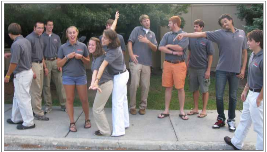
The stars of the department are our students! Our 2011 student ambassador group.