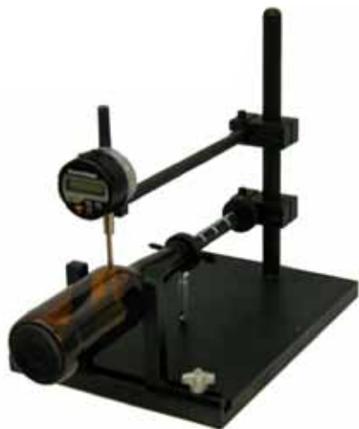
Narrow Neck Sidewall Thickness Gauge