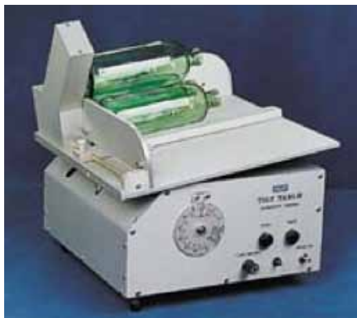
AGR Tilt Table