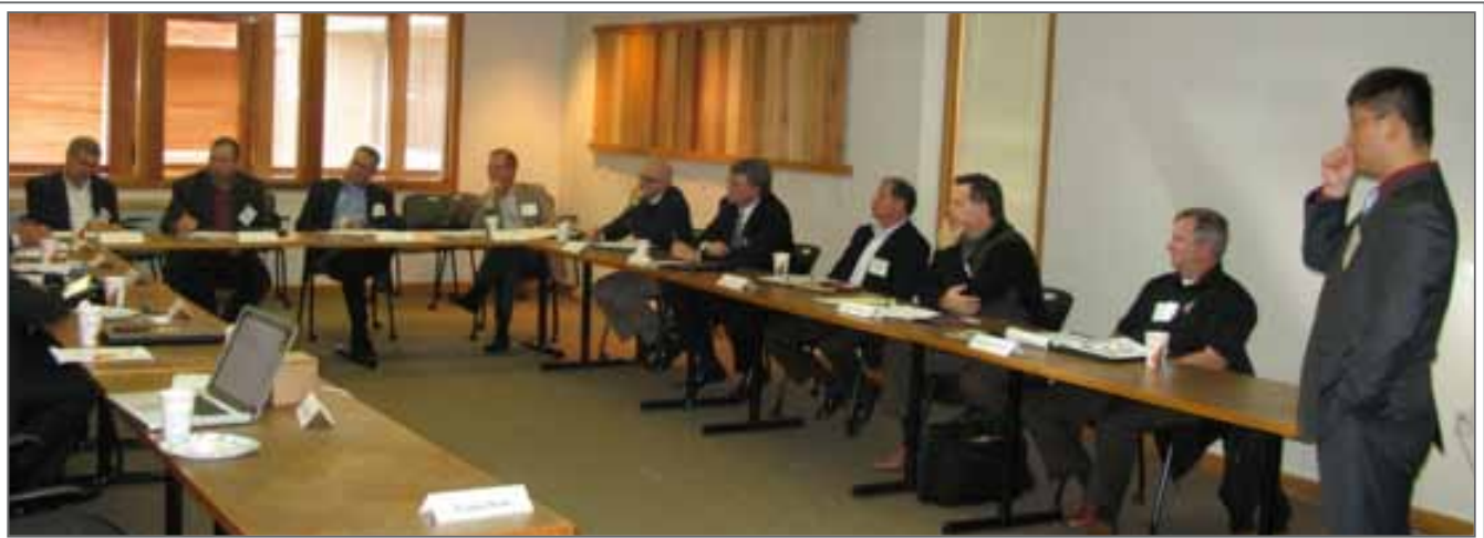
Global leading packaging industry came to Virginia Tech to discuss about the future of VT-Packaging and 2012 Packaging Summit conference.